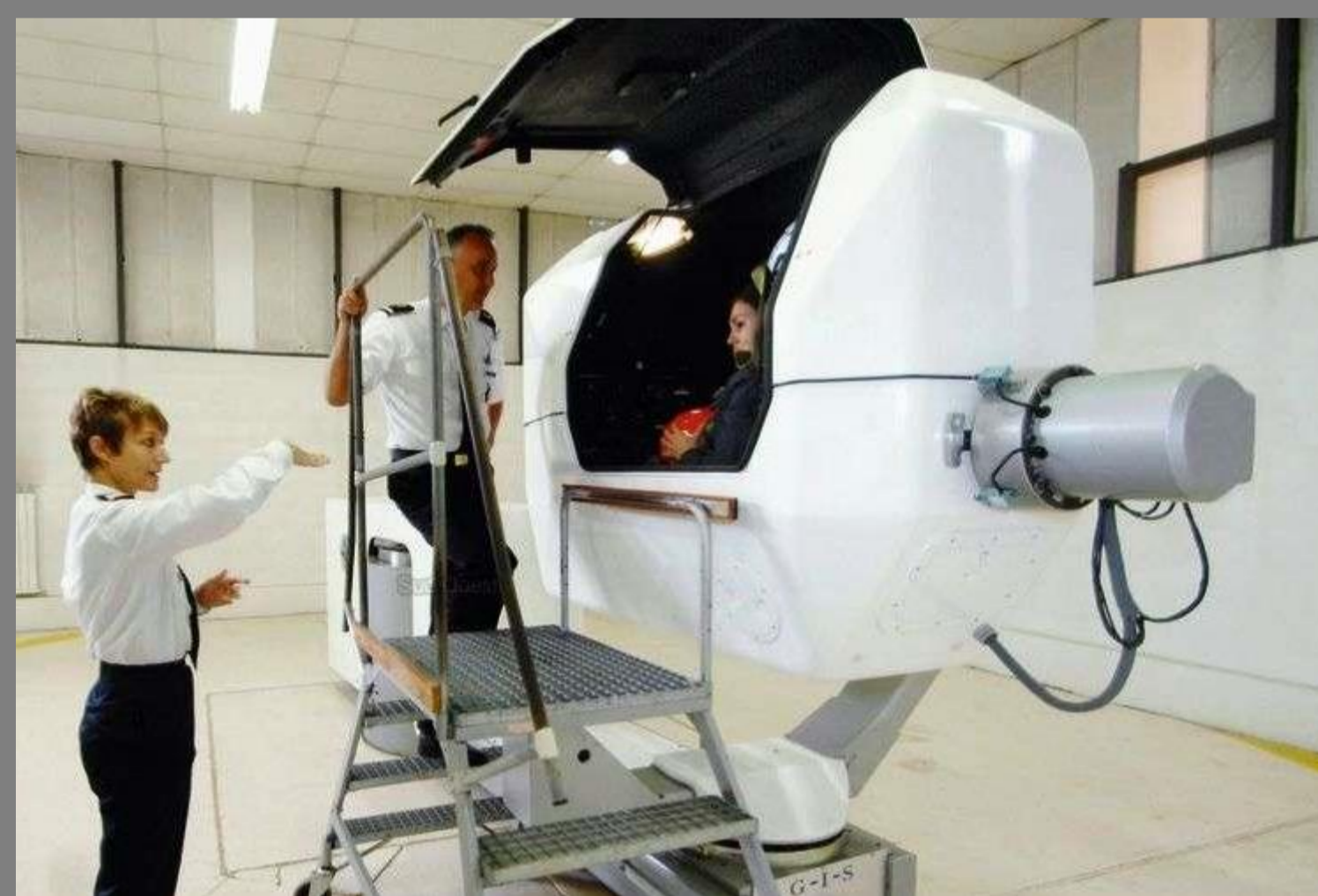
Sensorial Illusion Generator